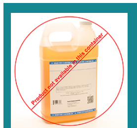
1-gallon jug SKU: CLEANAMO/1 UPC-12: 641238070764