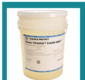
5-gallon pail SKU: CLEANAMO/5 UPC-12: 641238039280