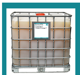
270-gallon tote SKU: CLEANAMO/NR270P UPC-12: 641238069195

Master STAGES™ CLEAN AMO™ | ©2004-2021 Master Fluid Solutions® | 2021-12-27