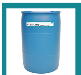
54-gallon drum SKU: CLEANAMO/54 UPC-12: 641238039310